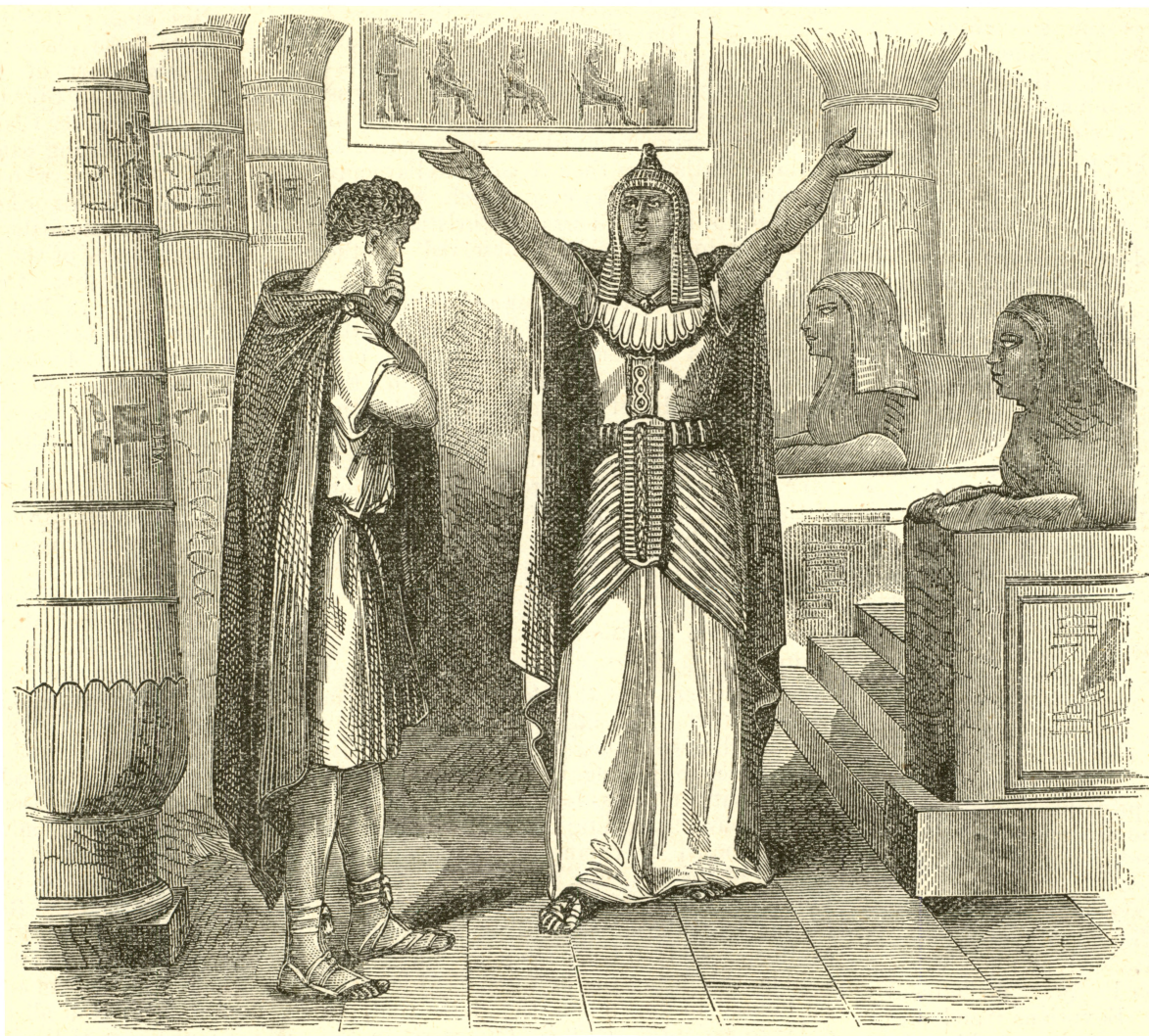
In the Temple of Osiris.

"The influence of the sun on nature," says the "Encyclopedia Britannica," "either brightening the fields and cheering mankind, or scorching and destroying with pestilence, or again dispelling the miasma collected from marshes by night, was . . . taken to be under the control of a divine being, to whom men ascribed, on human analogy, a form and